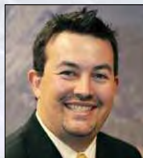
Curtis Snyder Sports Information